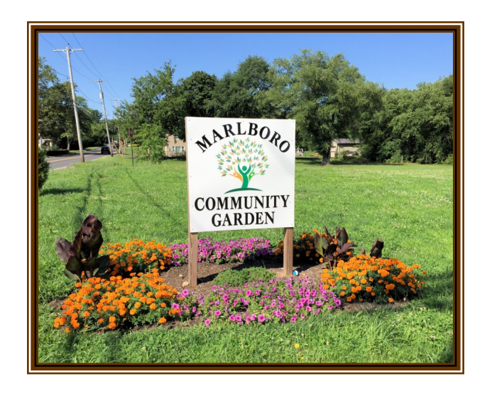
82 Tennent Road Morganville N.J. 07751 http://www.marlboro-nj.gov/garden