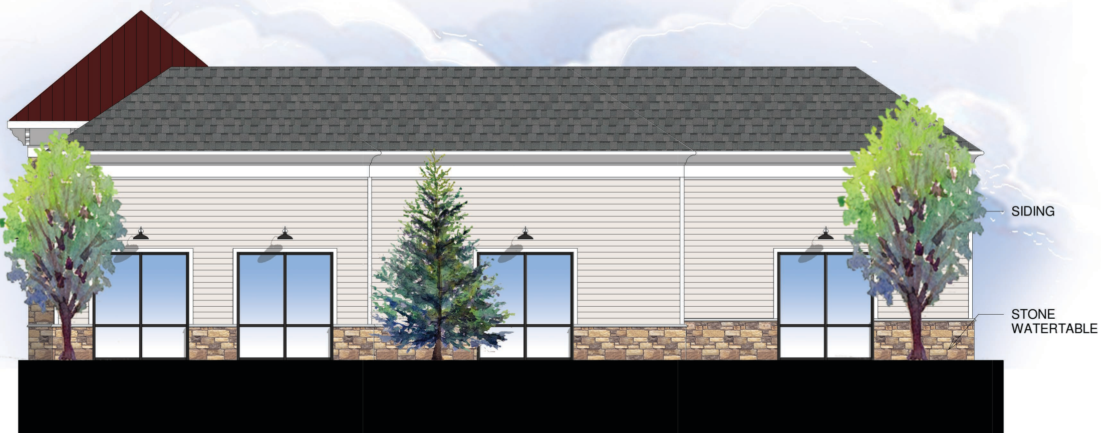
Right Elevation Scale: 1/8" = 1'-0"