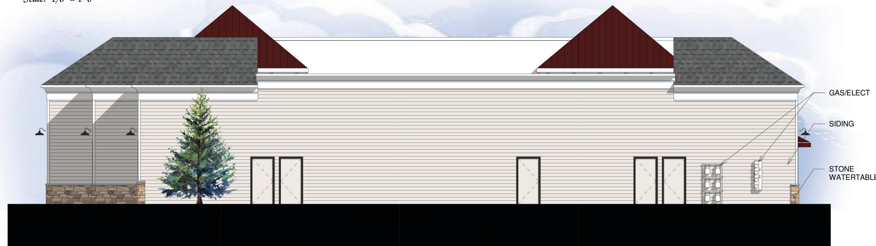
Rear Elevation Scale: 1/8" = 1'-0"