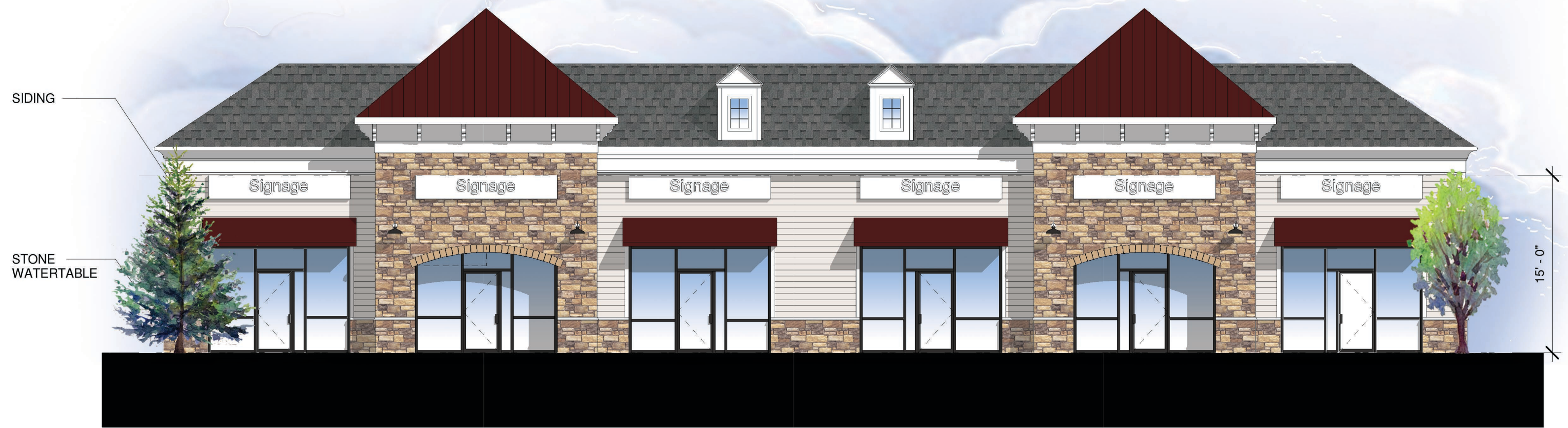
Front Elevation (Route 79) Scale: 1/8" = 1'-0"

C:\Users\crisrina\Documents\MG_Mariboro commercial_2020-01-08_cristinaruberte@hotmail.com.rvt