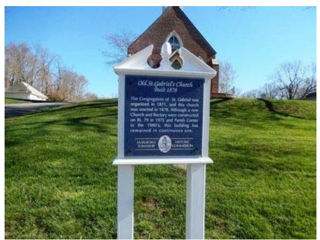
Figure 6 - Old St. Gabriel's Church, Marlboro