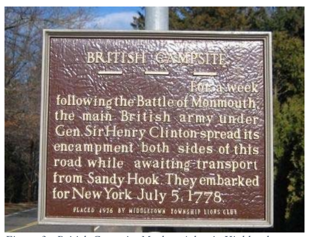
Figure 3 - British Campsite Marker, Atlantic Highlands