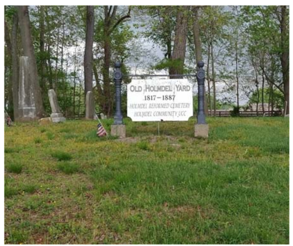
Figure 2 - Sample historic marker from Holmdel