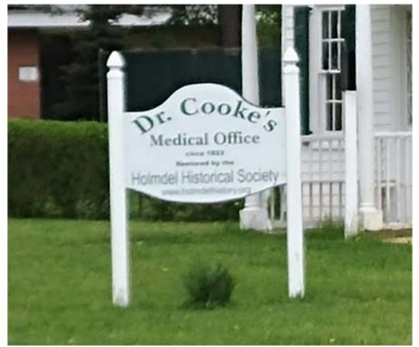
Figure 1 - Sample historic marker from Holmdel