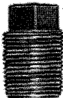
Brass plug - Square head with I.P. thread